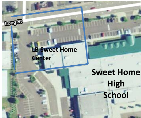
Sweet Home Center – in Sweet Home High School