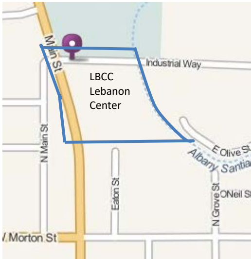
Lebanon Center 44 Industrial Way, Lebanon

Health Occupations Center 300 Mullins Dr., Lebanon