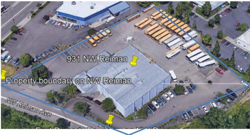
Benton Center North – 931 NW Reiman