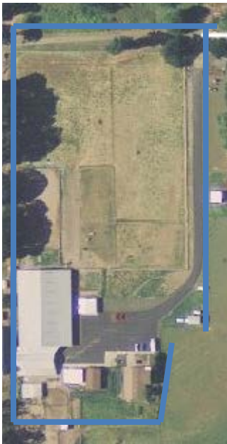
Horse Center – 2258 SW 53rd