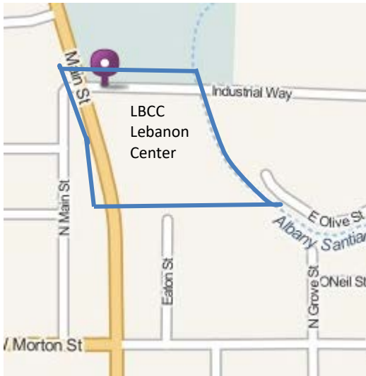
Lebanon Center 44 Industrial Way, Lebanon

Health Occupations Center 300 Mullins Dr., Lebanon