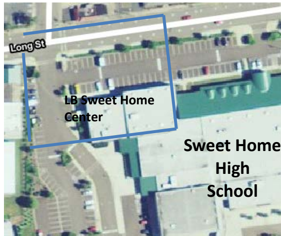
Sweet Home Center – in Sweet Home High School